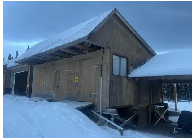
Old shed = needs a little love

Our well-used storage shed was built many years ago by dedicated volunteers. It is invaluable for storing race equipment & grooming gear. However, the shed has issues that put it at high risk from ever-increasing wildfires. If it burns, it will likely set fire to the nearby garage that houses our new groomer. To keep these assets safe, we plan to put the old shed on a concrete foundation, install soffits to prevent embers from entering & new metal siding. We secured a grant that will fund 50% of project costs, we need to raise $10,000 from membership to combine with club reserve funds to match the grant. Help us secure our assets! Keep your eyes out for further communication; the link to the fundraiser will soon be posted on our website.