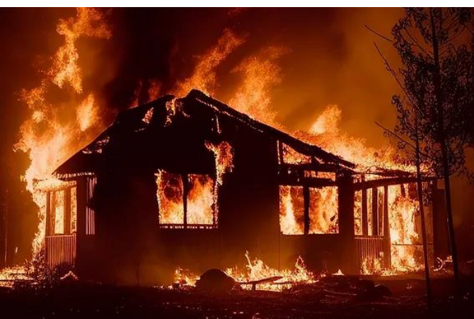
Not the way we want the reno to happen

Any amount helps & we appreciate your contribution to improving our Nordic facilities while keeping trail fees low. All donations will be provided with a tax receipt.