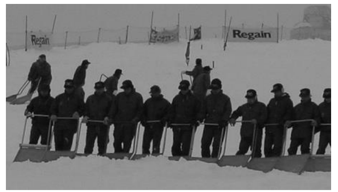
Tenacious groomers hard at work

Now something not positive: I was disgruntled, to say the least, to see dog tracks, together with ski tracks on Pine Creek Far Loop. Is this the same person who removed the No Dog Allowed signs?? My question is who entered the trail first, the Dog or the Human? Regardless of the answer, it's shameful & disrespectful.