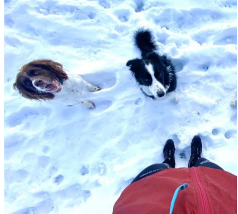
Ski dogs waiting impatiently for their owner to find the right podcast

Send responses to <u>communications@bvnordic.ca</u> by Feb 15<sup>th</sup>. Include 3-5 images of your ski dog!