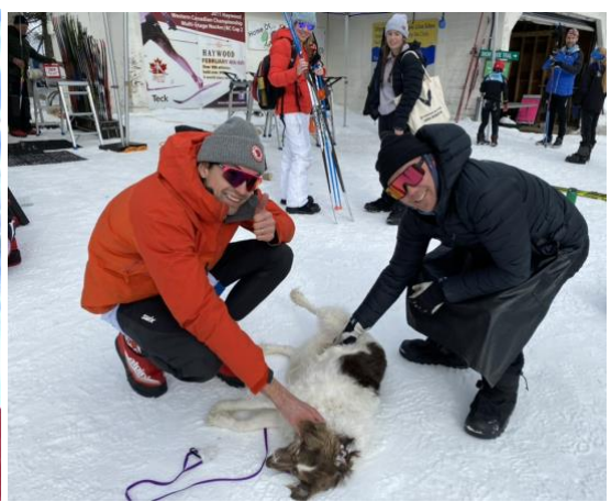
Waiting for the spa paw wax treatment from the club wax team