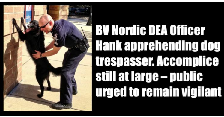
Dog Enforcement Officer (DEA) Public Service Announcement