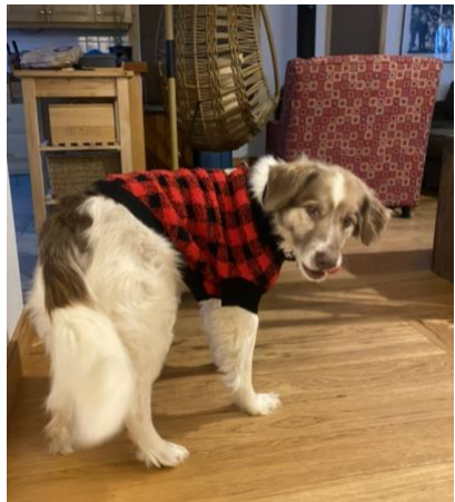
Sovereign Lake Nordic Canine race kit, where is the BVCCSC version?