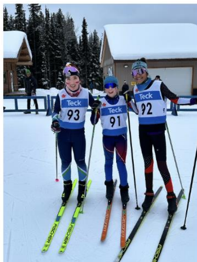
Junior skiers: BVCCSC, Caledonia (PG), Nechako Nordics (Vanderhoof)