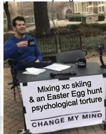
Easter Egg Hunting Crew!